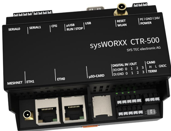
Figure 1: Top view of device

The sysWORXX CTR-500 extends the SYS TEC electronic AG product range within the field of IoT and control applications. It is an innovative, Linux-based compact controller for universal processing purposes of standard industrial signals. The controller module provides to the user numerous local in- and outputs as well as versatile communication interfaces. Due to CAN and Ethernet interfaces, it is suited for realizing decentral control tasks in distributed fieldbus systems of automation technology. With all these tools and interfaces, one can write their own applications for their specific needs and purposes.